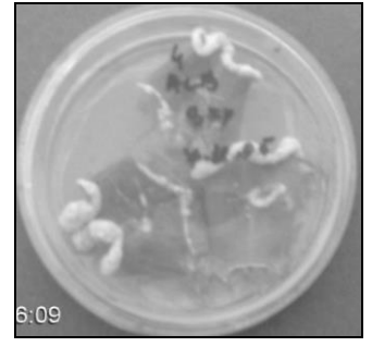
Figure 1. Callus initiation at the cut end of leaf segments on MS media supplemented with BAP (3 mg/l)

Ten days of in vitro culture were sufficient to allow the callus initiation that occurred at the cut end of leaflet (Figure 1).