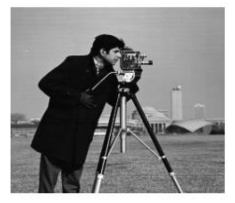
Figure 1. Cameraman Image

are considered to show the efficiency in terms of MSE and PSNR. The CFO value considered in the simulation is \epsilon_u = [-0.05, 0.05] .