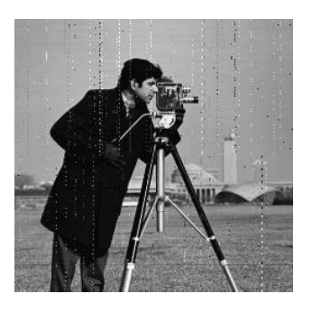
(i) ZF with LFDMA