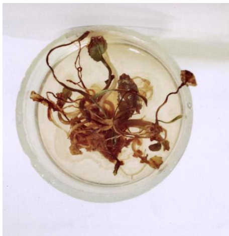
Figure 2. The aspect of untransformed shoots cultivated on kanamycin containing medium.

The morphological aspect of the transformed shoots was similar to the control variant but their growth in the presence of the antibiotic is the proof of the expression of nptII gene in these tissues.