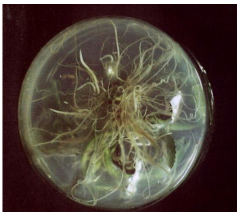
Figure 1. Shoots and hairy roots of Armoracia sp. transformed with A.rhizogenes Ar40.

Short time after infection (three weeks) with A.rhizogenes K599, callus, root and shoot primordial appeared at the infection sites and developed abundantly on MS hormone-free medium (figure 1).