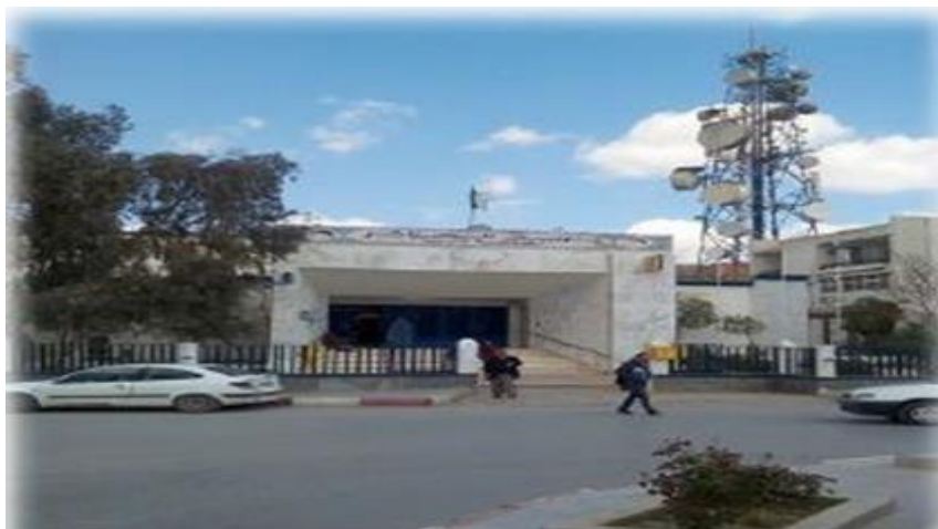
Photo No. 10 Equipment Next to the park.

The park is surrounded by a series of important installations, making it a transit point and a place for the residents using these installations. From these installations, mention is made of the municipal centre and the Post and Transport Centre, as shown in photos No. 10.