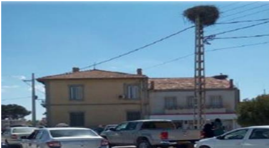
Photo No. 9 Housing next to the park.

Owing to the park's location in the city centre, the surrounding dwellings are sparse, except on the western side (Al-Sarraj neighbourhood) we find individual dwellings dating back to the colonial period as pictured No. 9.