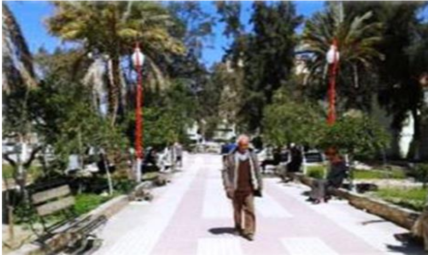
Photo No. 4 Moukrani Park.